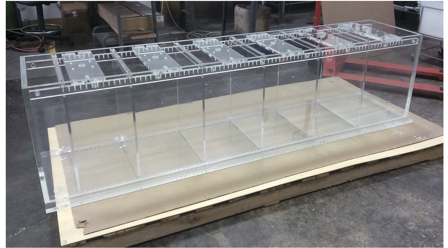
Chambered Tank for Product Display Acrylic - Dimensions: 8' x 2' x 30"H