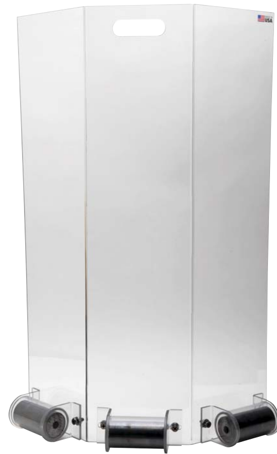
Weighted Safety Shield Polycarbonate - Dimensions: 19 x 6 x 30"H